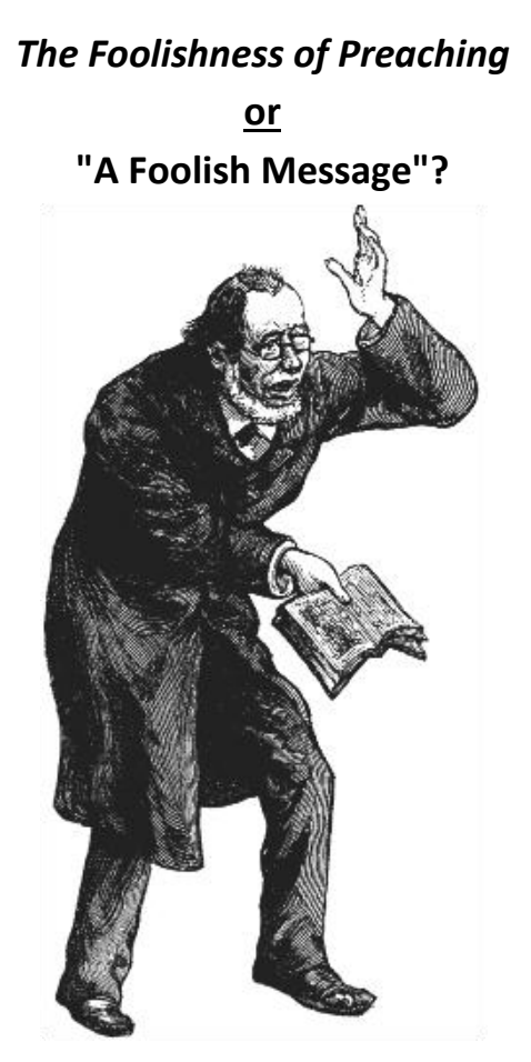
1 Corinthians 1:21 - Compare...